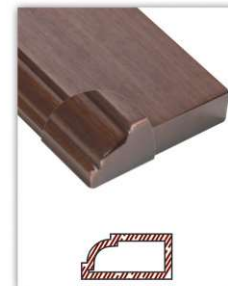
Step Round Step