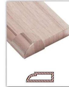
Step quarter round