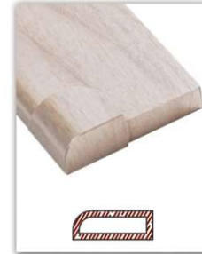
German Quarter round (9mm)