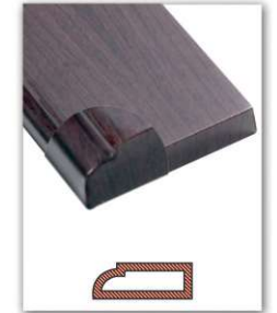
Step German quarter round