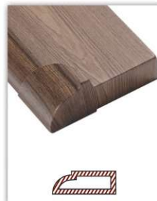
Step quarter round