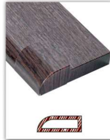
Quarter round (12mm)